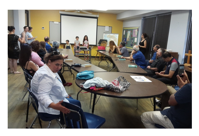
Visitors are always welcome!